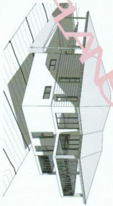
3D View 2